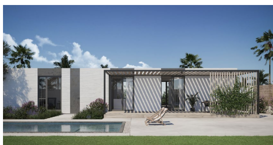
Mighty Houses - Cinco