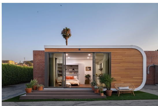
Mighty Mods - Mighty Studio