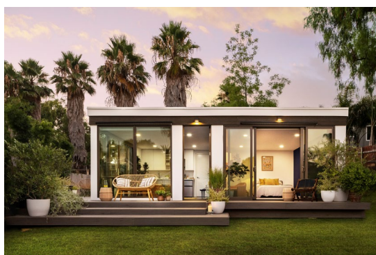
Mighty Mods - Mighty Duo B